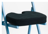
Actyv™ Coccyx Comfort Cushion 440 x 415 mm