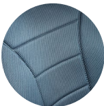
Heathcoat 3D Spacer Fabric