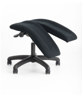
Actyv™ Articulated Leg Rest Pad dimensions 480 x 500 mm