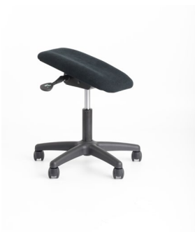
Actyv™ Single Leg Rest Pad dimensions 480 x 270 mm