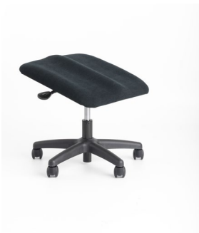
Actyv™ Double Leg Rest Pad dimensions 480 x 500 mm