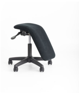
Actyv™ Single Articulated Leg Rest Pad dimensions 660 x 270 mm