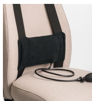
Actyv™ Portable Lumbar Support Regular: 200 x 100 mm Inflatable