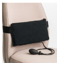
Actyv™ Portable Lumbar Support Large: 300x150 mm Inflatable