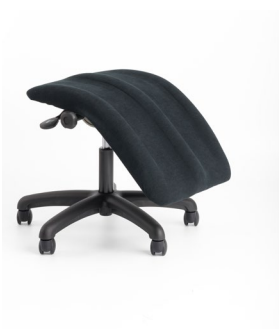
Actyv™ Double Articulated Leg Rest Pad dimensions 660 x 550 mm