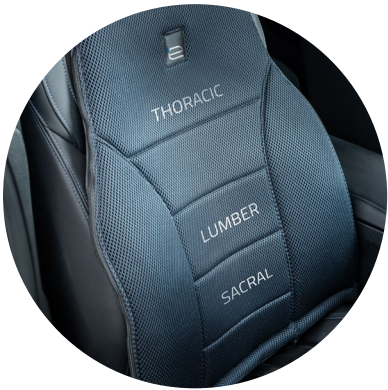
Air Cell Areas