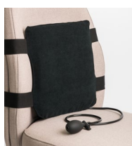
Actyv™ Reactive Lumbar Support 300x300 mm Inflatable