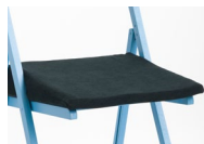
Actyv™ Seat Wedge 400 x 400 mm