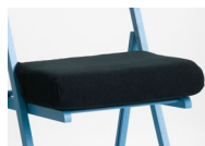
Actyv™ Comfy Cushion 420 x 420 mm