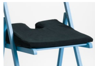
Actyv™ Coccyx Cot-out Wedge 400 x 400 mm