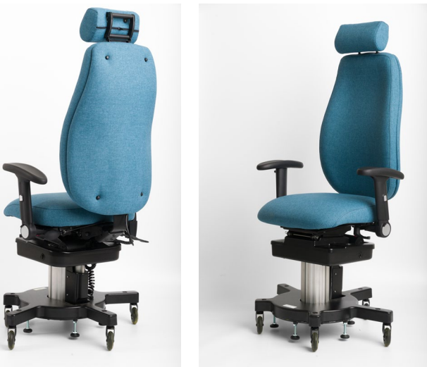
Adapt 660 - Shown in Time 6031 fabric with Neck Roll and height adjustable arms