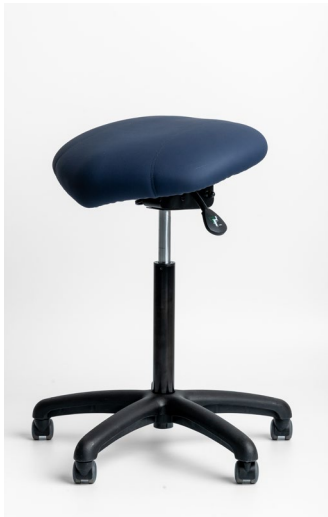
Zenki Sit/Stand - Shown in Valencia Faux Leather