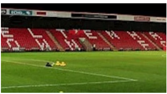
CHELTENHAM TOWN SHIRT & MATCH

TICKETS A shirt signed by the 23/24 squad alongside tickets to a match hosted by Ergochair's very own Gavin Garthwaite.