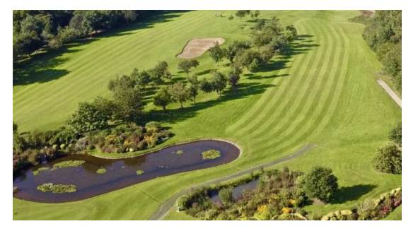
4 BALL AT COTTRELL PARK

A four ball at the world renowed Cotrell Park Golf Club, Glamorganshire..